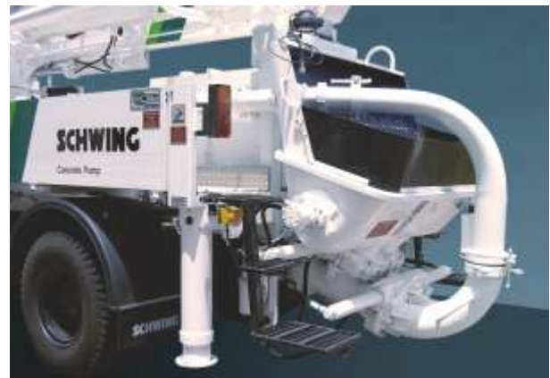
Gate Valve system

The delivery system has options of Flat gate valve / Rock valve system. Flat gate valve is known for its success with tough concrete and Rock valve is known for its pumping characteristics, low wear behavior, rebuilding qualities and safety.