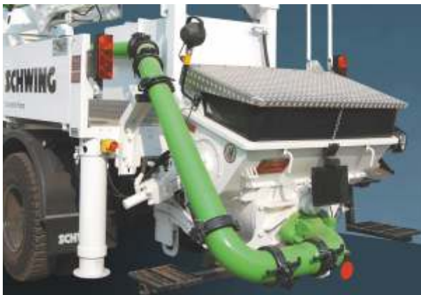
Rock Valve system

Thanks to it's lightweight superstructure and modular design it is possible to mount on a 16 Ton truck that fulfills most of our customer's needs. The compact size of this boom truck makes it usable under bridges, on barges, inside excavation and dam sites. It is the ultimate 'Urban Machine' which can be used to pump many residential jobs with minimum set up time.