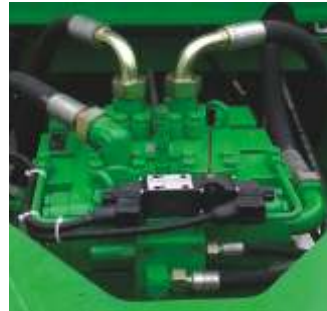
Integrated control block

The easy access to all the parts of the machine ensures that maintenance requires the minimum time for maintenance so your machine is up and running in no time at all.