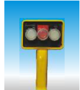
10m remote comes as a standard