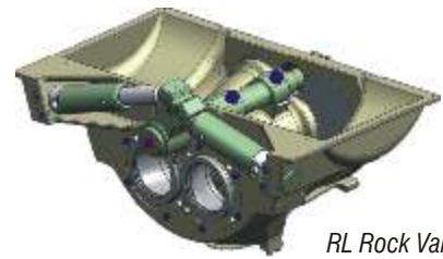
RL Rock Valve

Made after years of extensive study in the behaviour of tough concrete mixes, this valve is ideally suited for pumping harsh concrete and can withstand rugged site conditions as in India. This valve has been recognised worldwide as the toughest concrete valve. The optional hard-facing is also recommended.