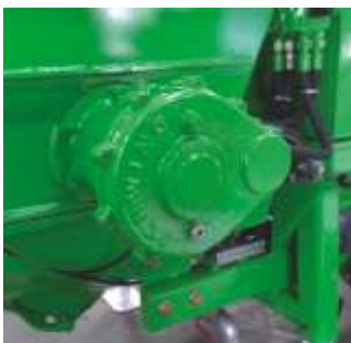
Gearbox drive for agitator

Direct high-torque driven on to the agitator shaft as well as robust design of all hydraulic components in conjunction with constant flow micro-filtering of the hydraulic oil ensure operational reliability and a long service life.