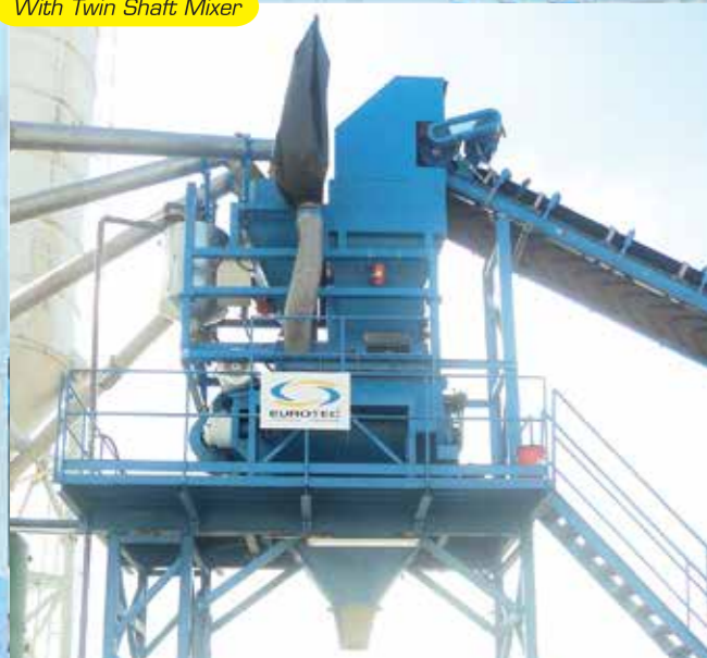
With Twin Shaft Mixer

Introducing the EuroTec ECO range of concrete batch plants currently offered in 30m 3 /hr-60m 3 /hr. Plants are available with Eurotec's Planetary Pan Mixer or Eurotec's MB Twin Shaft Mixers. All weighing systems are metered via load cell and managed through Eurotec's own in house ECS control software running on an operator friendly windows environment.