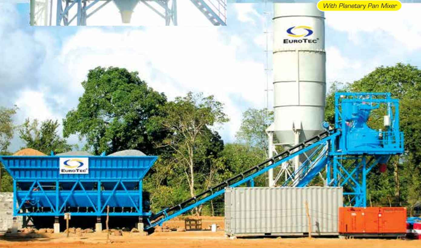
With Planetary Pan Mixer

Introducing the EuroTec ECO range of concrete batch plants currently offered in 30m 3 /hr-60m 3 /hr. Plants are available with Eurotec's Planetary Pan Mixer or Eurotec's MB Twin Shaft Mixers. All weighing systems are metered via load cell and managed through Eurotec's own in house ECS control software running on an operator friendly windows environment.